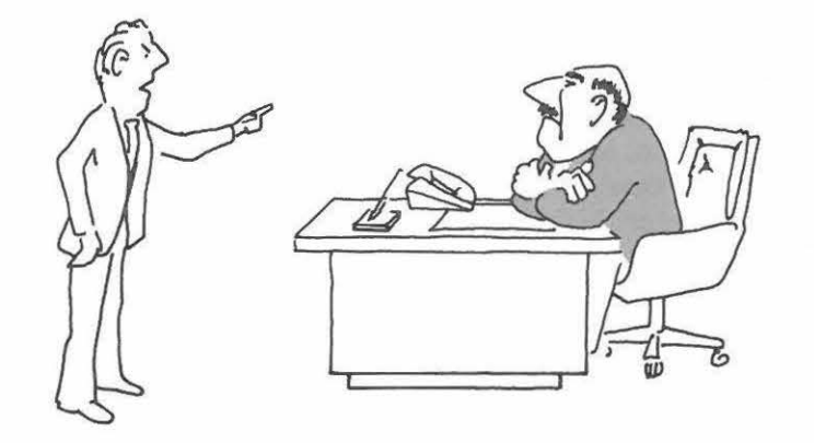
"I can't find an efficient algorithm, because no such algorithm is possible!"

To avoid serious damage to your position within the company, it would be much better if you could prove that the bandersnatch problem is in herently intractable, that no algorithm could possibly solve it quickly. You then could stride confidently into the boss's office and proclaim: